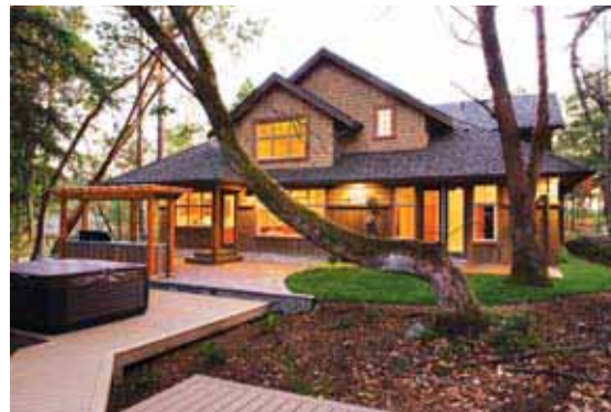
Oceanwood Built Green™ development, Saanich