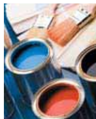
Low VOC paint