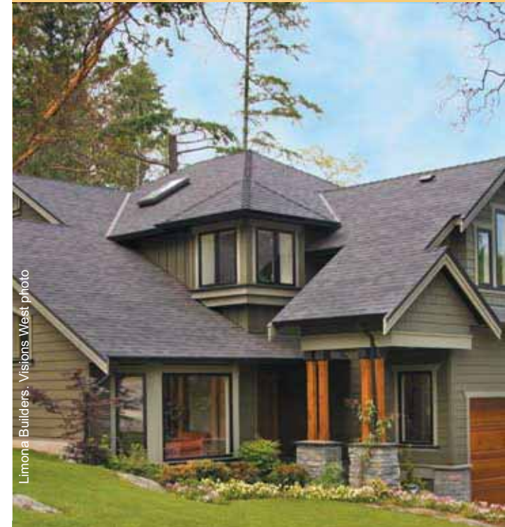
Limona Builders